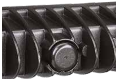
Nitto Breather Vent