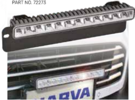
14" SINGLE ROW L.E.D LIGHT BAR WITH LICENSE PLATE BRACKET PART NO. 72273