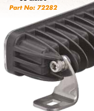
Stainless Steel Brackets