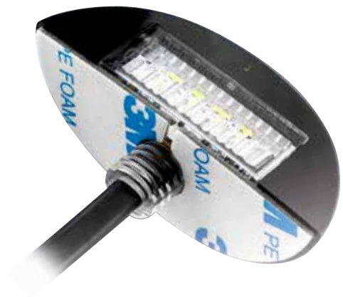
Part No. 60BLMB