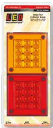
Part No 280ARM Stop/Tail/Indicator