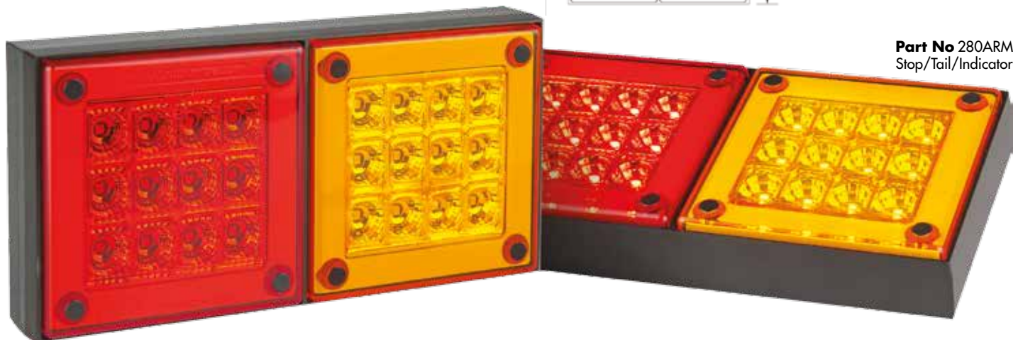
Part No 280ARM Stop/Tail/Indicator