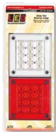
Part No 280RWM Stop/Tail/Reverse